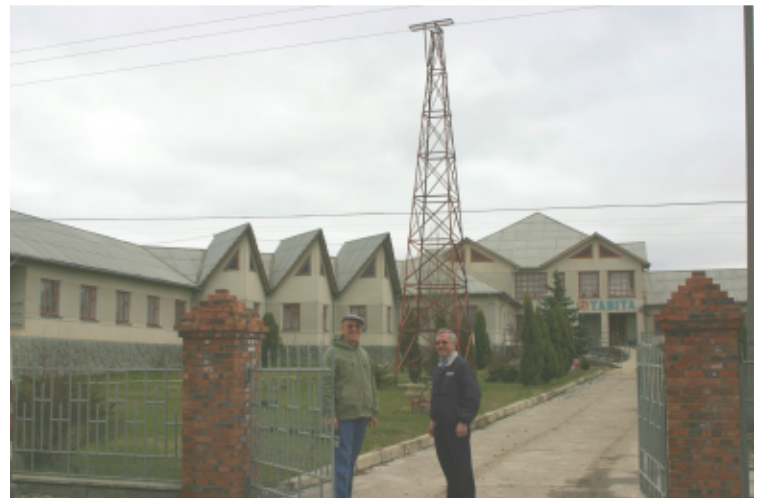
Tabita home for the elderly

Using funds provided by the Dutch organization Europa Desk, the Baptist Union built the home in 1996 with the intent that Tabita become self-supporting. Funds from the state and church collections also helped meet needs at Tabita. Until 2004, Europa Desk provided funds for operating expenses and the salaries of two employees. Currently, each resident receives a monthly state pension that is transferred directly