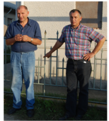
Directors of Tabita Home

Ongoing needs of Tabita include sufficient funds to adequately support staff. Cross Links contributes $370 (U.S.) each month toward staff salary and other expenses. An additional $400 (U.S.) is needed monthly to maintain qualified staff. Cross Links representative in Moldova, Igor Hmelic, suggests implementing alternative fuel systems utilizing methane gas or corn to reduce heating costs. Perhaps money saved on heating expenses could be allocated for salaries.