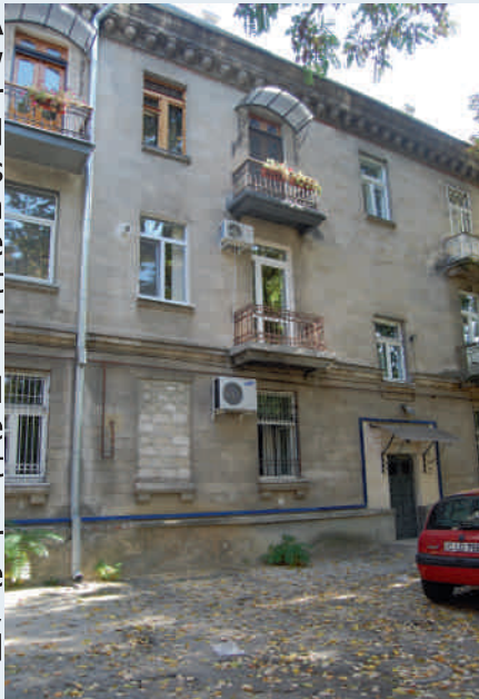
This building currently houses the Home Care offices

Services and medical supplies are offered free of charge if the patient is unable to pay. Ongoing needs exist for funds to purchase bandages, medications, crutches, walkers, and wheelchairs.