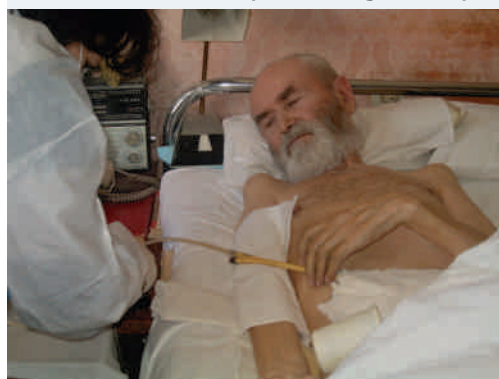
A Home Care staff person assisting a client

Home Care serves approximately 400 people with medical needs each year. Many of these people are lonely with no one else to provide adequate care. Some are terminally ill. Regular visits by Home Care staff help relieve loneliness and meet medical needs. In addition to providing for physical needs, staff